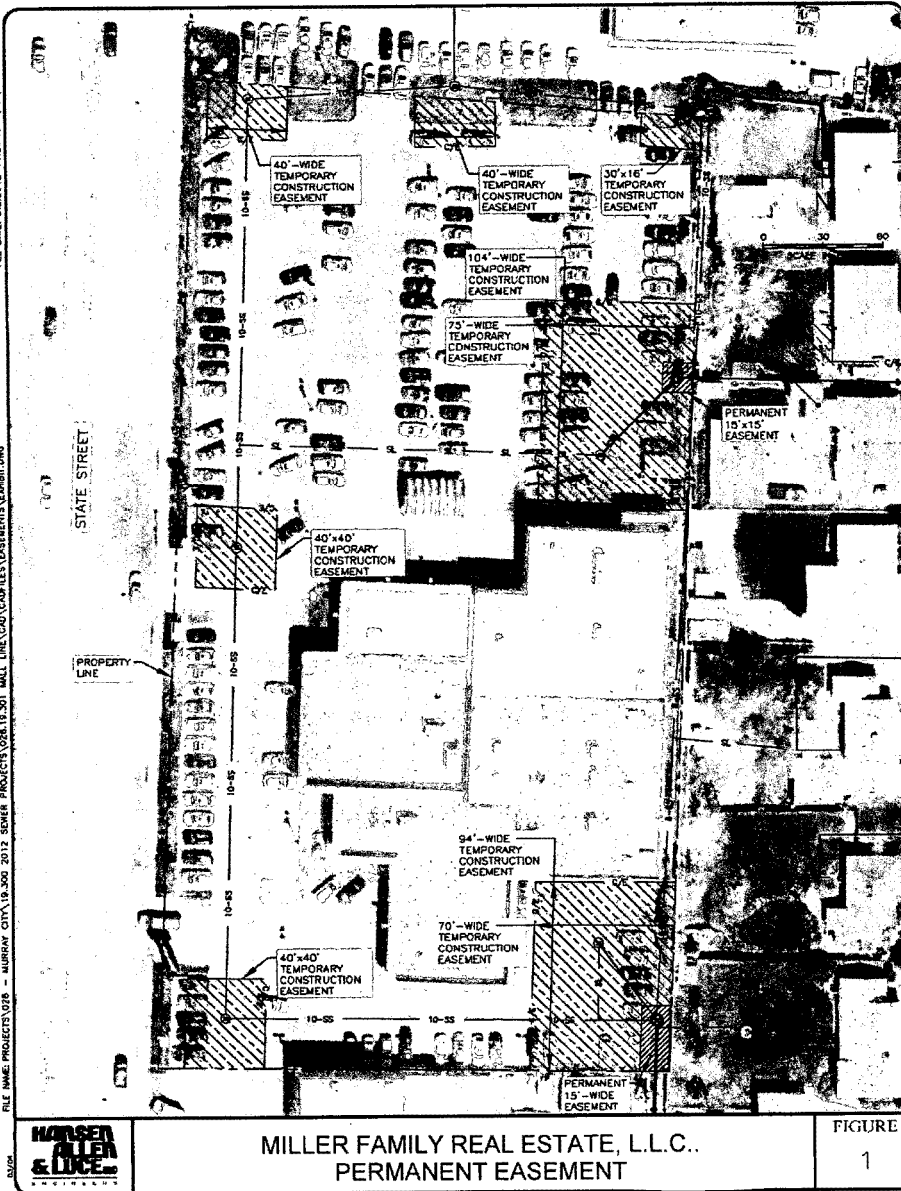
MILLER FAMILY REAL ESTATE, L.L.C. PERMANENT EASEMENT

FILE NAME: PROJECTS\078 - MURRAY CITY\19.000 2012 SEWER PROJECTS\028.19.301 MALL LINE\010\CADFILES\EASEMENTS\EXHIBIT.DWG