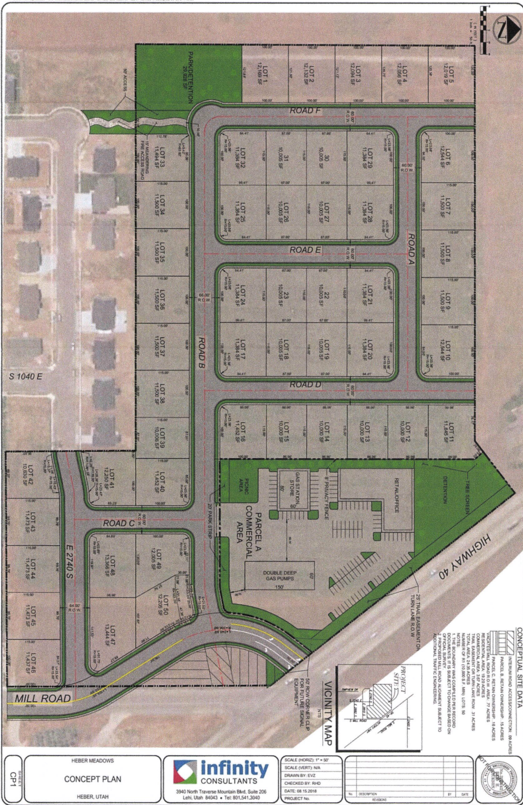
EXHIBIT B: Concept Plan/Map of Proposed Development