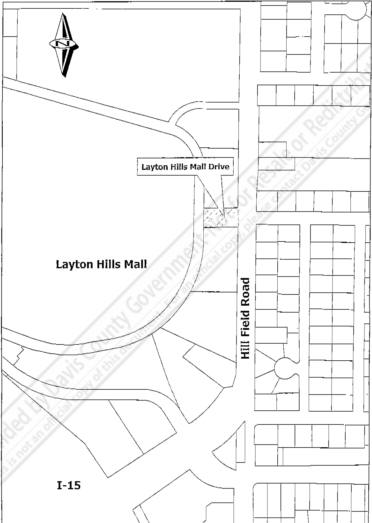
Layton Hills Mall -- East Entrance