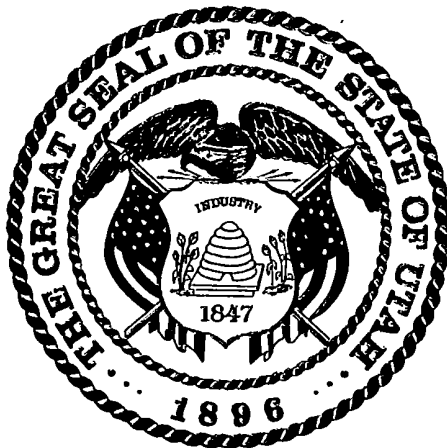
SPENCER J. COX Lieutenant Governor

IN TESTIMONY WHEREOF, I have hereunto set my hand, and affixed the Great Seal of the State of Utah this 30 th day of April, 2018 at Salt Lake City, Utah.