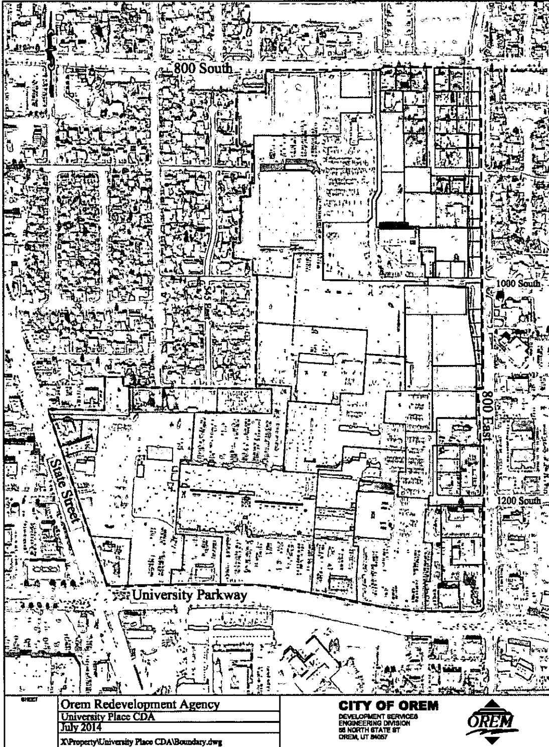
EXHIBIT B Project Area Map