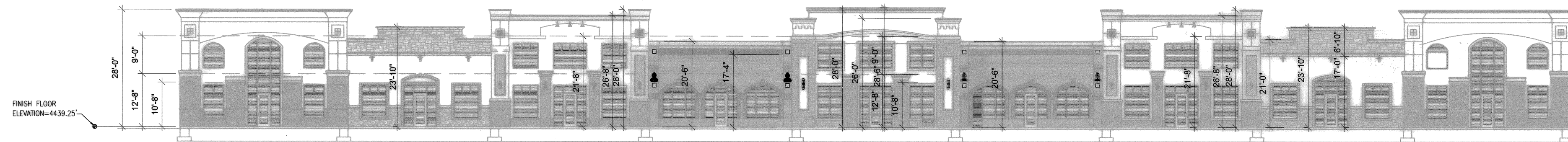
FRONT ELEVATION SCALE: 1/16" = 1'-0"

LAUREL SQUARE LOCATED IN THE SOUTHWEST QUARTER SECTION 30, TOWNSHIP 3 SOUTH, RANGE 1 EAST, SALT LAKE BASE AND MERIDIAN