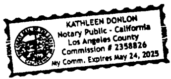
Place Notary Seal and/or Stamp Above

Signature [Handwritten Signature] Signature of Notary Public