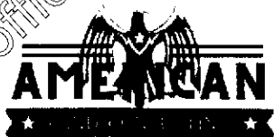
EXHIBIT A 50 FOOT PERMANENT EASEMENT

An easement that is 50.0 feet in width for the installation and maintenance of the Natural Resources Conservation Service Combined Disposal Pipeline. Said easement being more particularly described as follows: