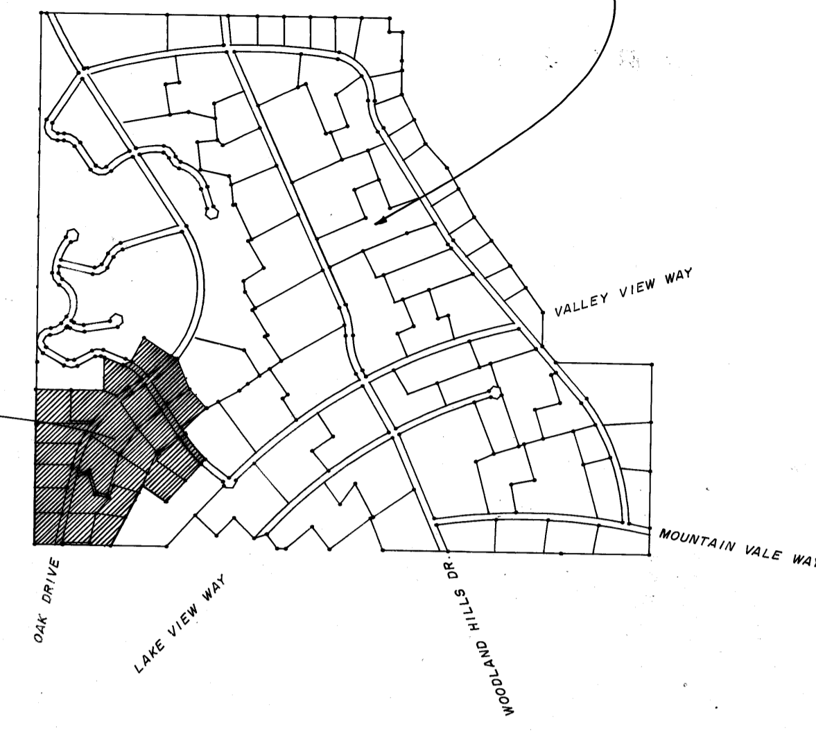
LOCATION MAP SCALE - 1" = 1000'