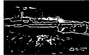
Total Photos: 1

Legal Description: COM W 1100.12 FT & N 3425.73 FT FR S 1/4 COR. SEC. 23, T5S, R1E, SLB&M.; S 70 DEG 0' 37" E 286.82 FT; ALONG A CURVE TO R (CHORD BEARS: S 68 DEG 48' 55" E 61.19 FT, RADIUS = 975 FT); S 67 DEG 4' 43" E 378.07 FT; S 83.2 FT; S 50 DEG 14' 11" W 36.28 FT; S 33 DEG 26' 6" W 62.83 FT; ALONG A CURVE TO L (CHORD BEARS: N 60 DEG 51' 22" W 702.37 FT, RADIUS = 4675.5 FT); N 0 DEG 46' 22" E 84.2 FT TO BEG. AREA 2.006 AC.