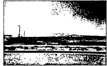
Total Photos: 1

*Taxing description NOT FOR LEGAL DOCUMENTS