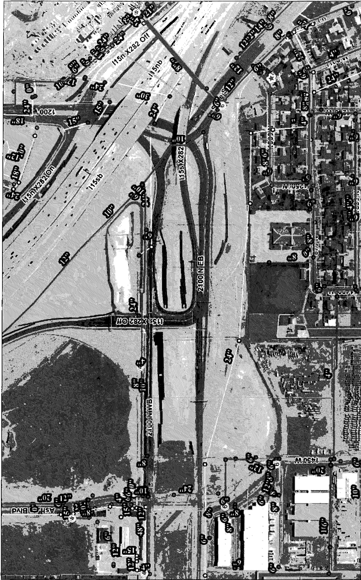
Exhibit B - Existing Lehi City Utilities within Prescriptive Easements