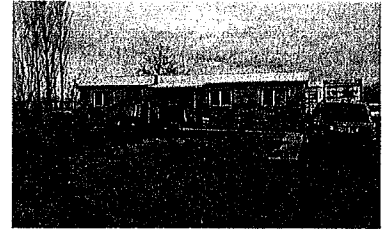
Total Photos: 2

Legal Description: COM 53 1/3 RDS E OF SW COR OF SEC 35, T7S, R2E, SLM; E 56.67 RDS; N 320 RDS; W 56.67 RDS; S 320 RDS TO BEG. AREA 113.34 AC.