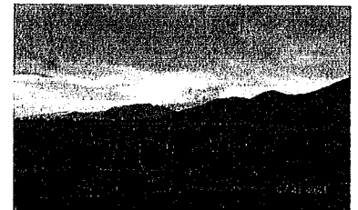
Total Photos: 3

Legal Description: COM N 323.4 FT FR W 1/4 COR. SEC. 31, T7S, R3E, SLB&M.; N 660 FT; S 88 DEG 45' 0" E 220.97 FT; S 0 DEG 42' 23" W 659.95 FT; N 88 DEG 45' 0" W 203.47 FT TO BEG. AREA 3.286 AC.